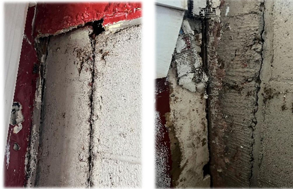
Crumbling interior walls and foundation