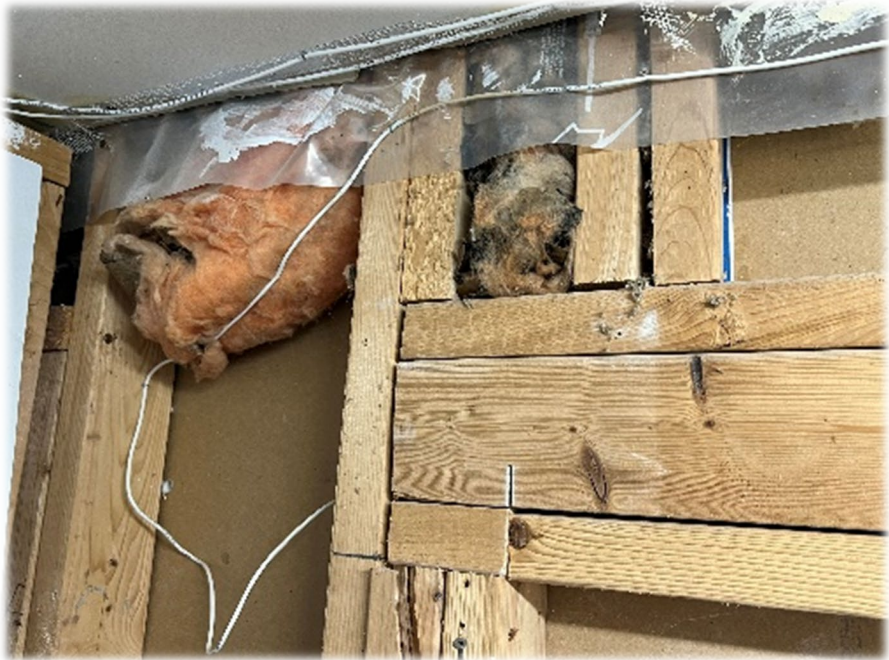
Interior walls showing degraded, exposed insulation and exposed wiring.