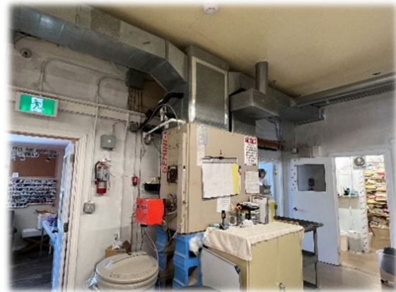
Furnace room and central area for laundry and animal washing stations