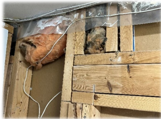
Poorly insulated Interior walls