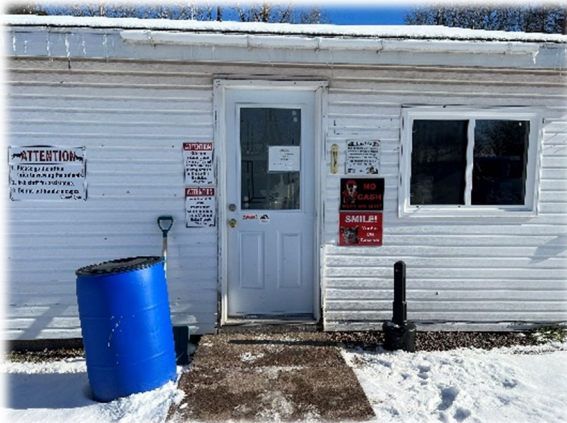
The main entrance to the LA Animal Shelter is exposed to the elements and not accessible

To ensure we have an animal shelter, we must build this new facility.