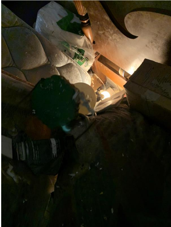
Second-floor bedroom. Light fallen onto mattress and papers.