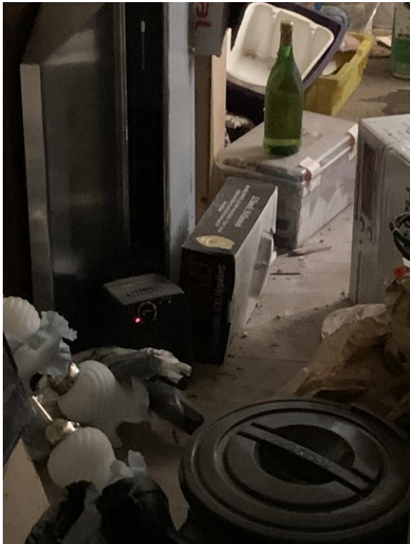
Space heater on and running.