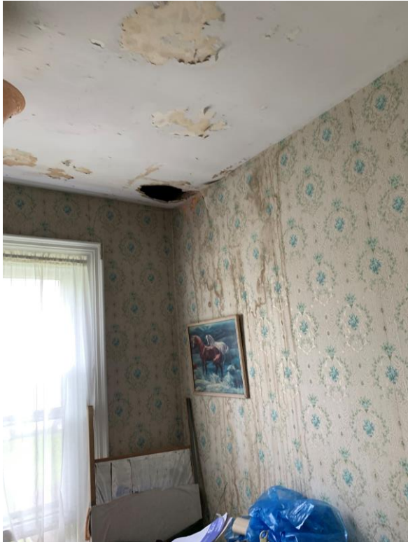
Water damage on second-floor.