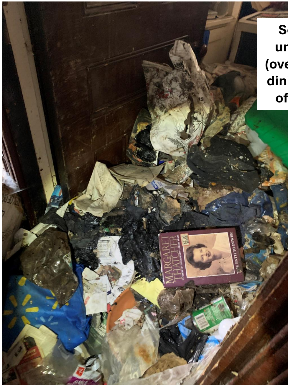
Second floor of unoccupied unit (over the main floor dining/living space of the occupied)