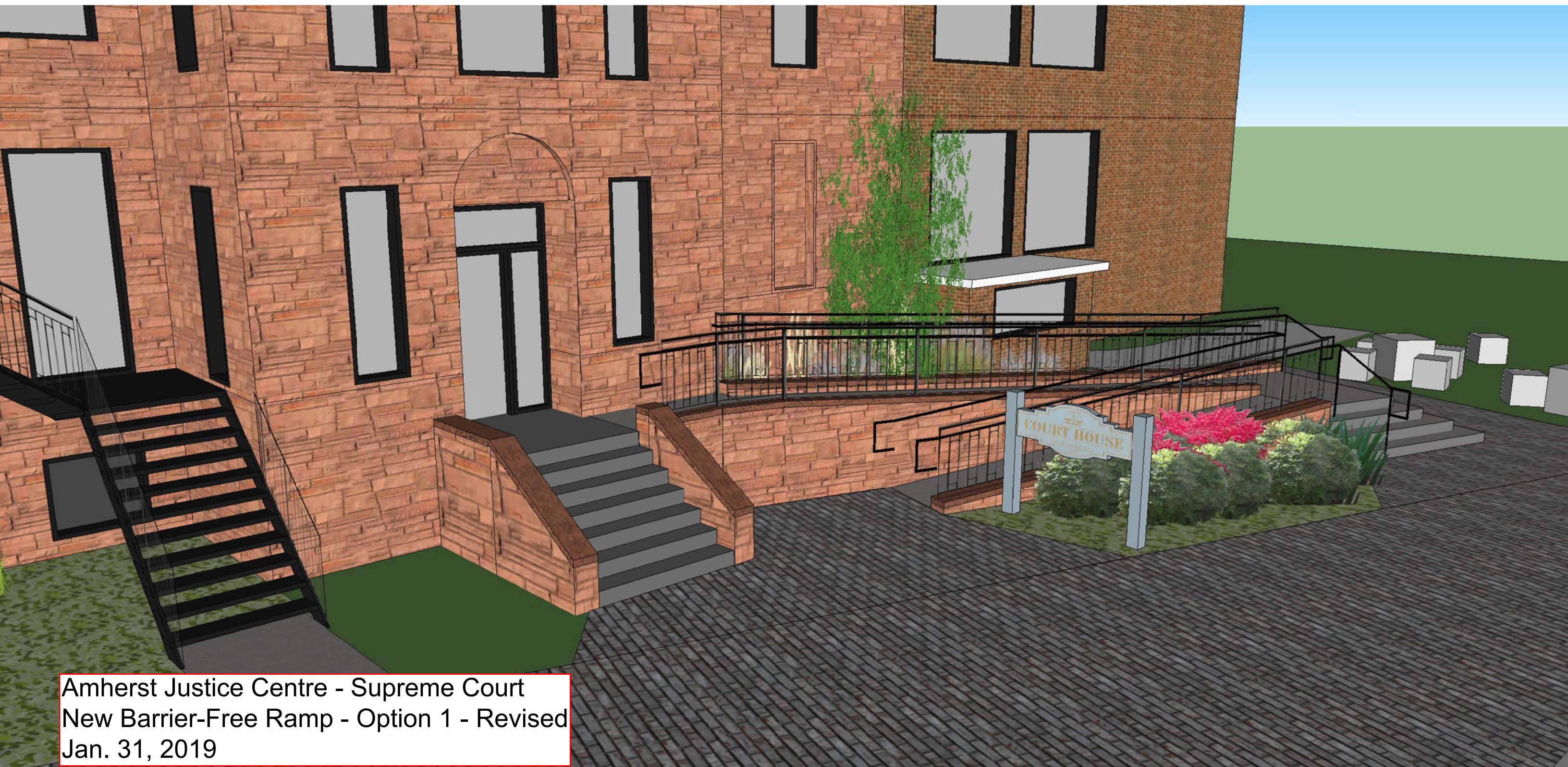
Amherst Justice Centre - Supreme Court New Barrier-Free Ramp - Option 1 - Revised Jan. 31, 2019