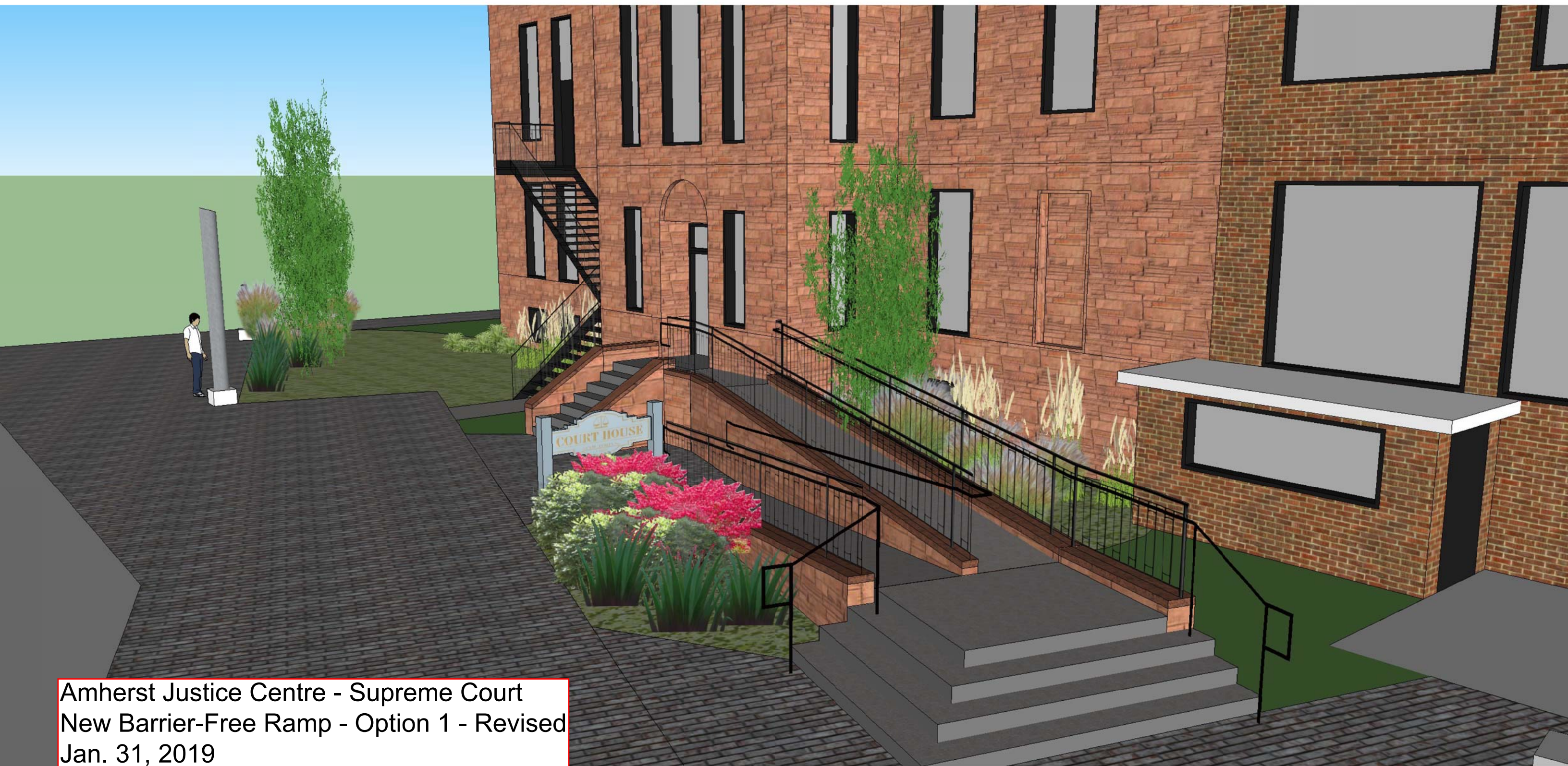
Amherst Justice Centre - Supreme Court New Barrier-Free Ramp - Option 1 - Revised Jan. 31, 2019