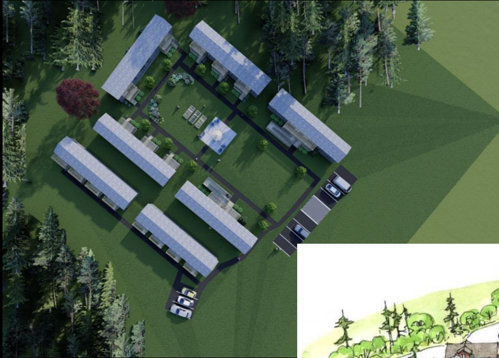
New Glasgow, NS Under Construction